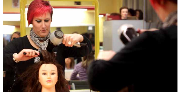
In the project OPIR, Belgian hairdresser students had the chance to participate in a mobility exchange project with a Romanian VET-school.