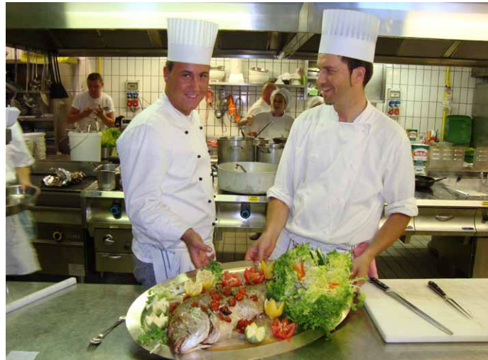
M.O.T.O. worked on a range of qualifications from the tourism and catering sector.