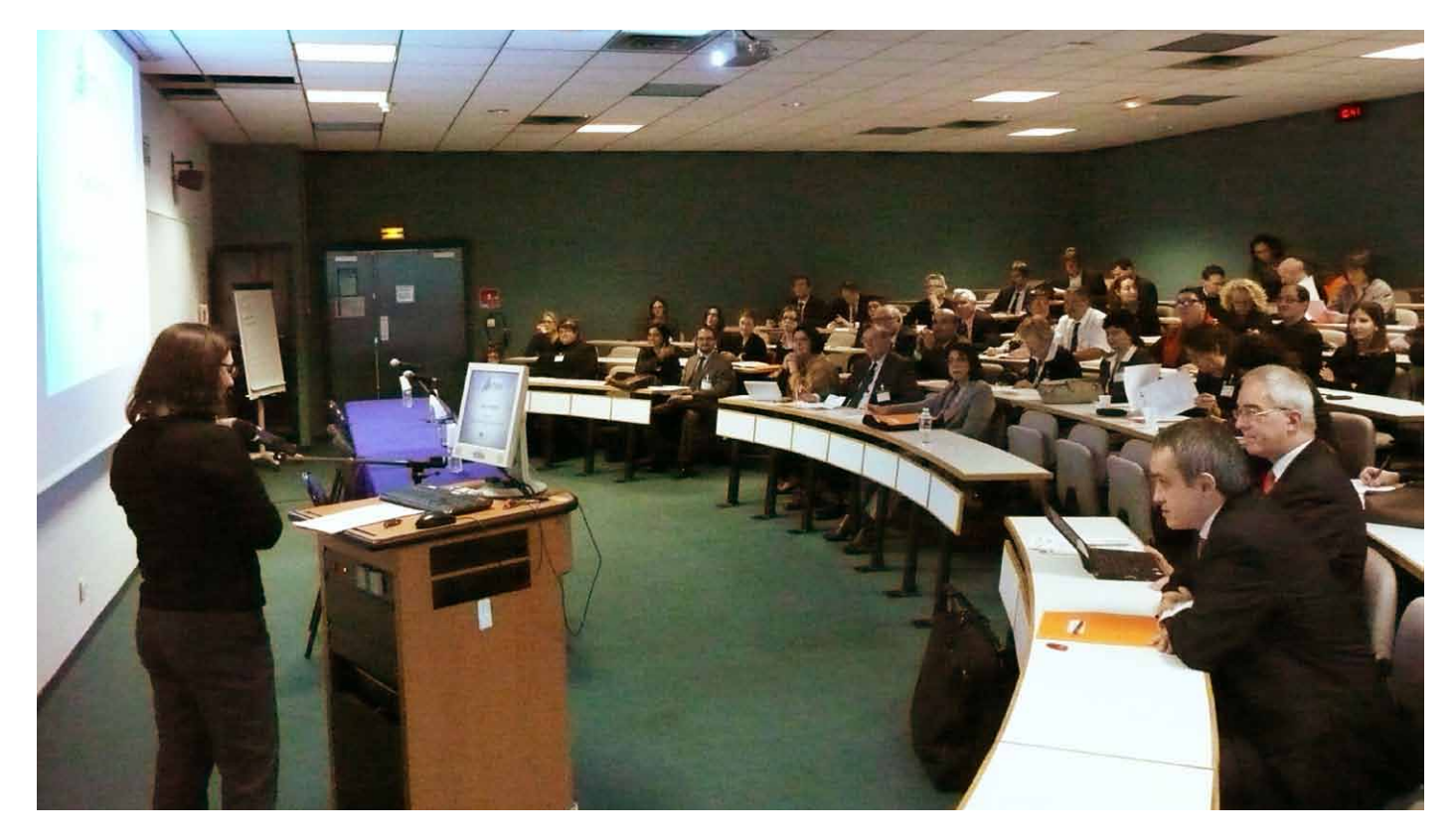
Be-TWIN final conference December 2012 in Paris