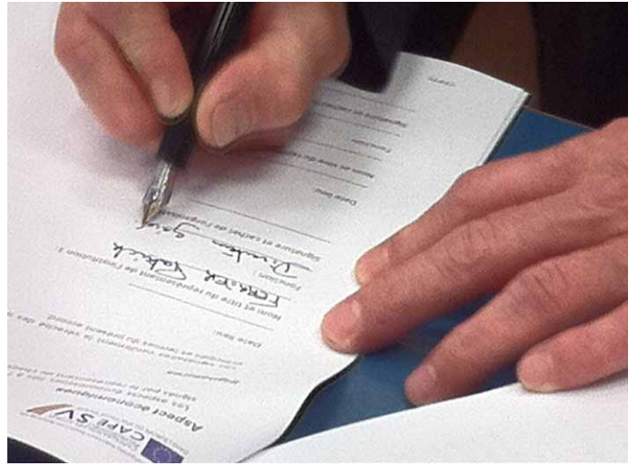
As a result of CAPE-SV, the partners signed a Memorandum of Understanding, stating the conditions for long-term cooperation.

identified and common procedures for recognition, accumulation and transfer were agreed and formalised. Learning outcomes were grouped according to stages of the production process in the performing arts industry: planning, designing, implementing, and evaluating. In a next step, it was systematically described which learning outcomes can be assessed by which partner; in other words, which learning outcomes are currently part of the existing qualification pathway.